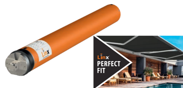
FOLDING ARM AWNINGS (3+ ARMS)

FOR ADDED PROTECTION, COMPATIBLE WITH: The Spinner Sun/Wind Sensor and The Shaker Motion Sensor