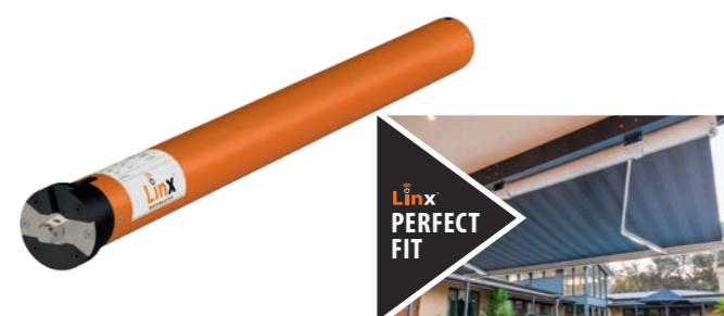
FOLDING ARM AWNINGS (2 ARMS)

FOR ADDED PROTECTION, COMPATIBLE WITH: The Spinner Sun/Wind Sensor and The Shaker Motion Sensor